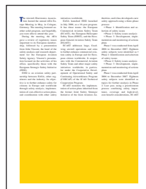
One-Half Page Horizontal 7" x 4 7/8"