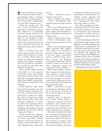
One-Sixth Page 2 1/4" x 4 7/8"