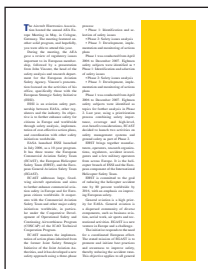
One-Third Page Vertical 2 1/4" x 10"