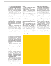
One-Third Page Square 4 1/2" x 4 7/8"