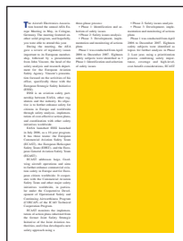
One-Half Page Vertical 4 1/2" x 7 1/2"

Call 816-347-8400 for information on uploading ad files to the Avionics News FTP site.